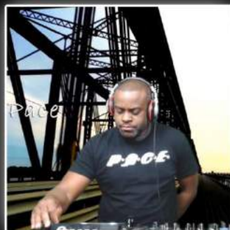
Pace at Soluble Sessions (Live video stream)