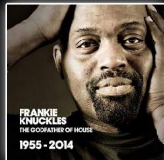
In Frankie Knuckles We Trust (House mix by Pace dedicated to the Godfather of House)