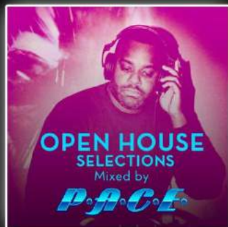
Weekly House Music Mix Podcast (Available on all Major Podcast platforms)